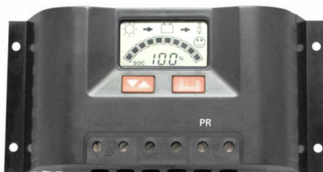
PR1010 PR1515 PR2020 PR3030